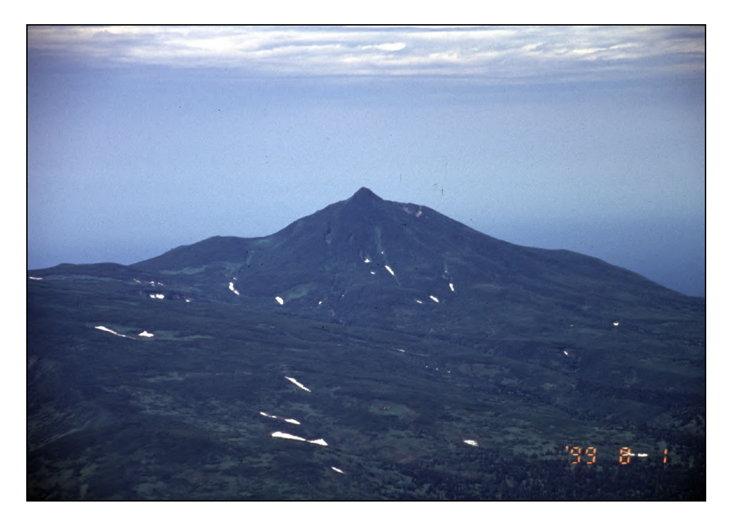
Ruruidake, taken from the summit of Chachadake to southeast on August 1, 1999.