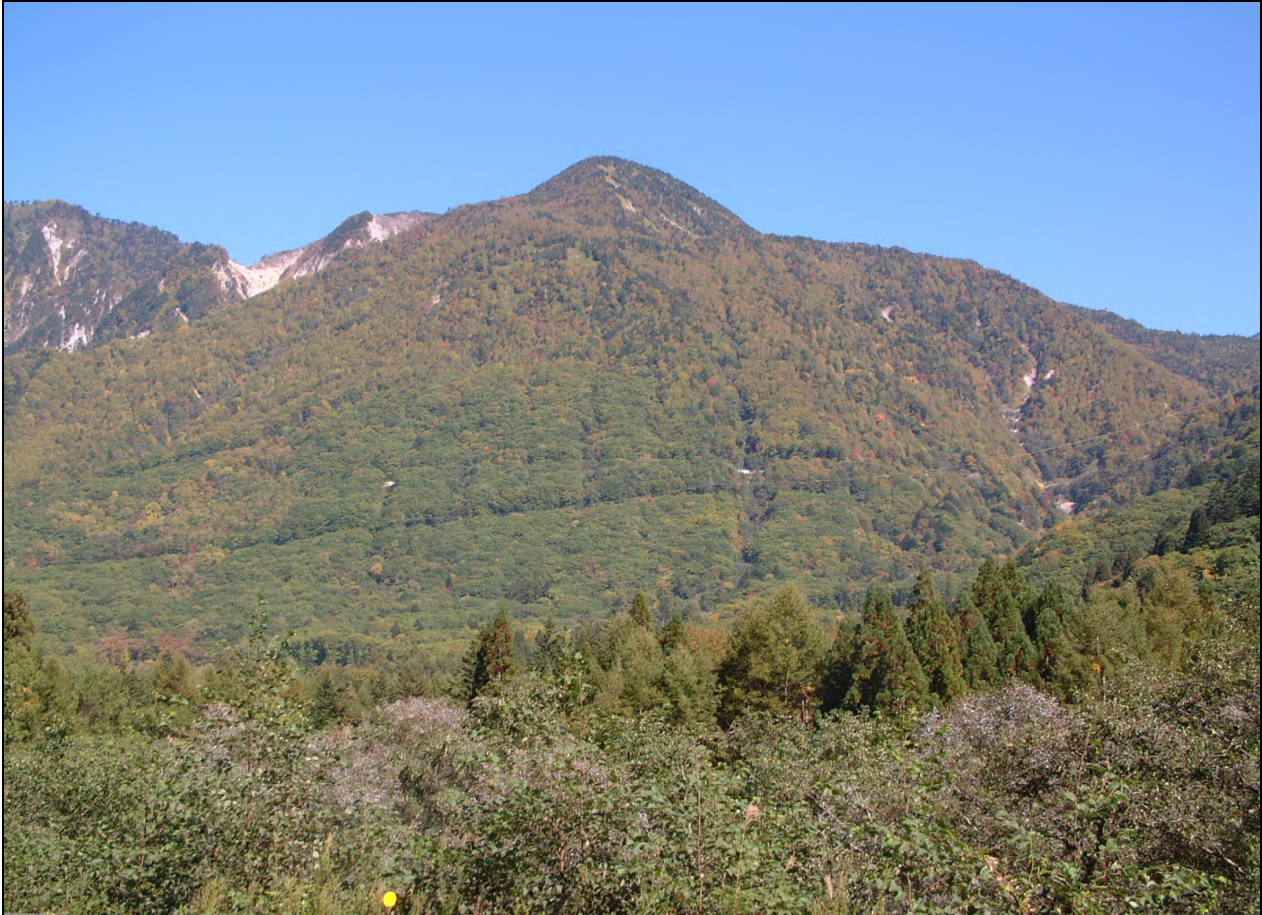
Overview of Akandanayama taken from the west side on October 19, 2003