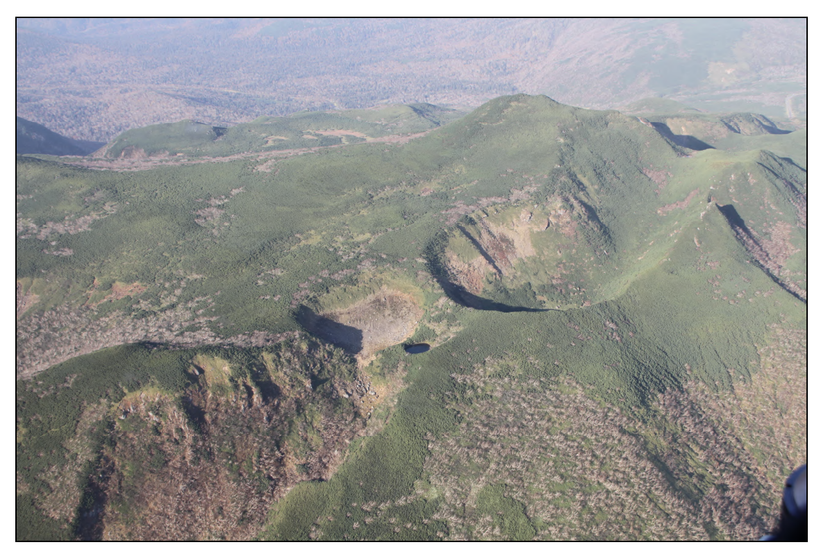
Overview of Tenchozan - Aerial Photo Taken from Southwest Side - October 19, 2011