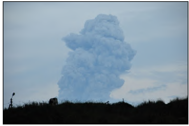
Etorofu-Yakeyama Eruption - Taken from North August 26, 2012