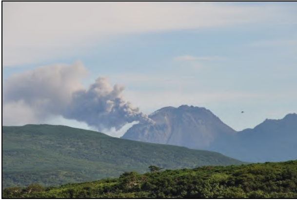
Etorofu-Yakeyama Eruption - Taken from North-northwest August 25, 2012